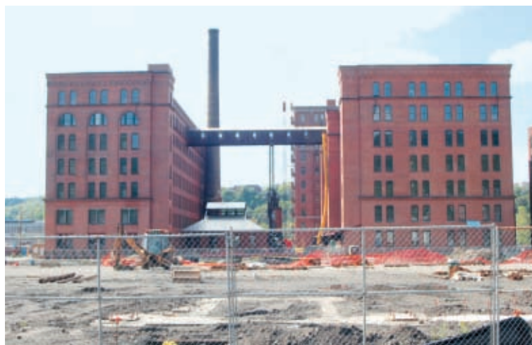
A 1901 cork factory is converted into lofts as Downtown's Strip District becomes a destination for living.

The Foundation has a longstanding commitment to the colleges and universities that attract talented students and faculty to southwestern Pennsylvania and also stimulate business development. Significant gifts in 2005 included support for a capital campaign at Duquesne University and for the second phase of a renovation project at Point Park University.