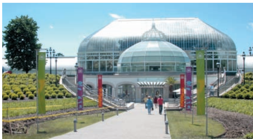
A new, green welcome center introduces visitors to historic Phipps Conservatory, one of America's largest Victorian greenhouses.

$150,000 to support the Allegheny Commons Pilot Project, part of a master plan for one of the region's most significant parks.