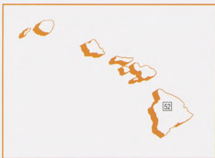
Maps of Alaska and Hawaii not to scale