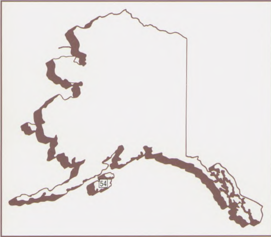
Maps of Alaska and Hawaii not to scale

As the nation's population increases, unplanned development of open spaces threatens to deprive future generations of the natural beauty and grandeur we have come to take for granted. The American Land Conservation Program was initiated in 1988 to acquire and preserve key tracts of land which were in danger of being lost to urban sprawl and environmentally insensitive development. The tracts described below are examples of some of the more significant projects acquired during 1998.