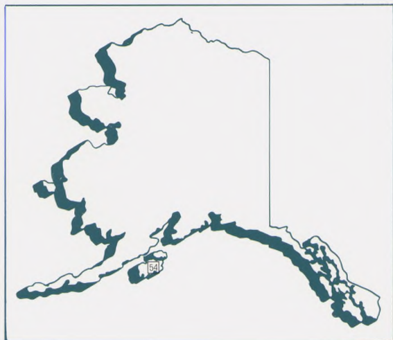
Maps of Alaska and Hawaii not to scale

As the nation's population increases, unplanned development of open spaces threatens to deprive future generations of the natural beauty and grandeur we have come to take for granted. The American Land Conservation Program was initiated in 1988 to acquire and preserve key tracts of land which were in danger of being lost to urban sprawl and environmentally insensitive development. The tracts described below are examples of some of the more significant projects acquired during 1997.